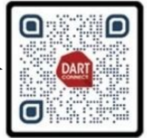
Scan To Go To MyDC

Scan QR Code or Go To: my.DartConnect.com